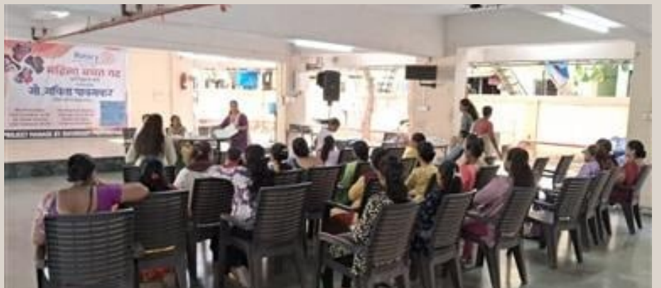
Financial Literacy for Women at Majiwada on 29/03/2026