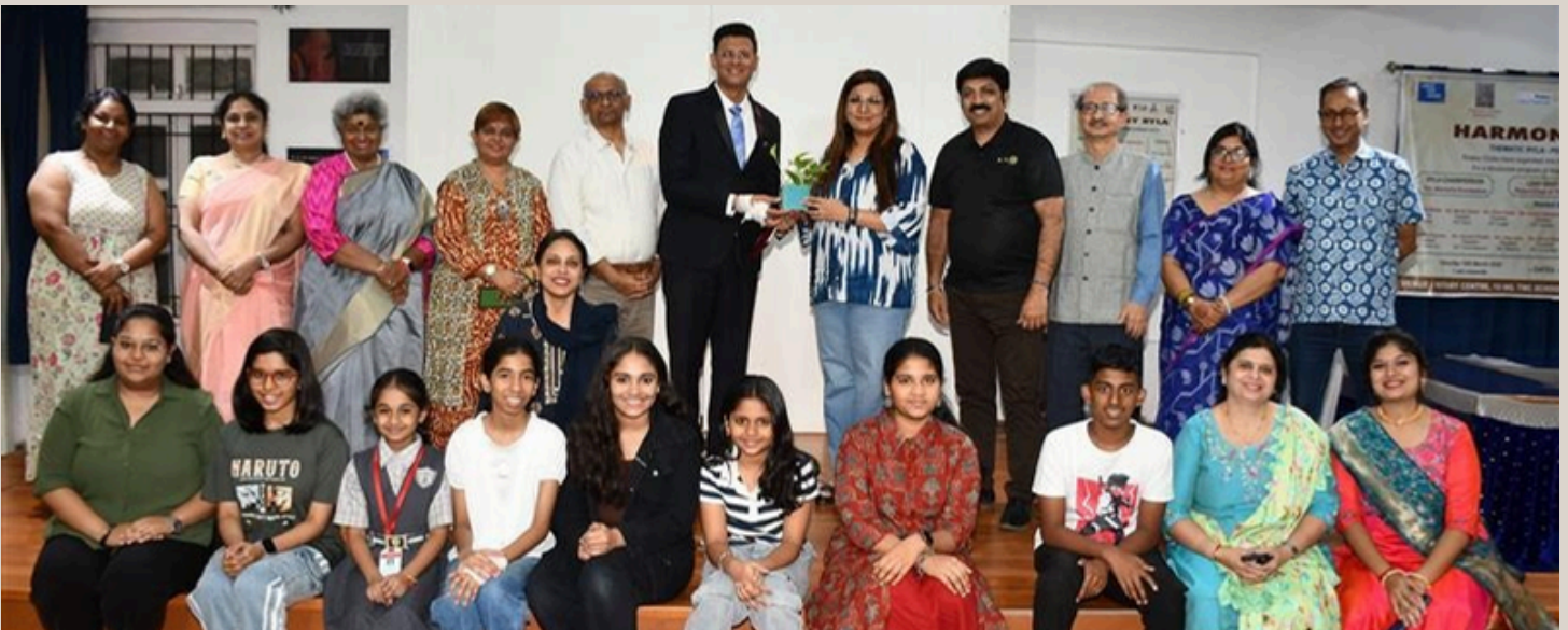
RYLA at Rotary Bhavan Thane Dt : 15/03/2026